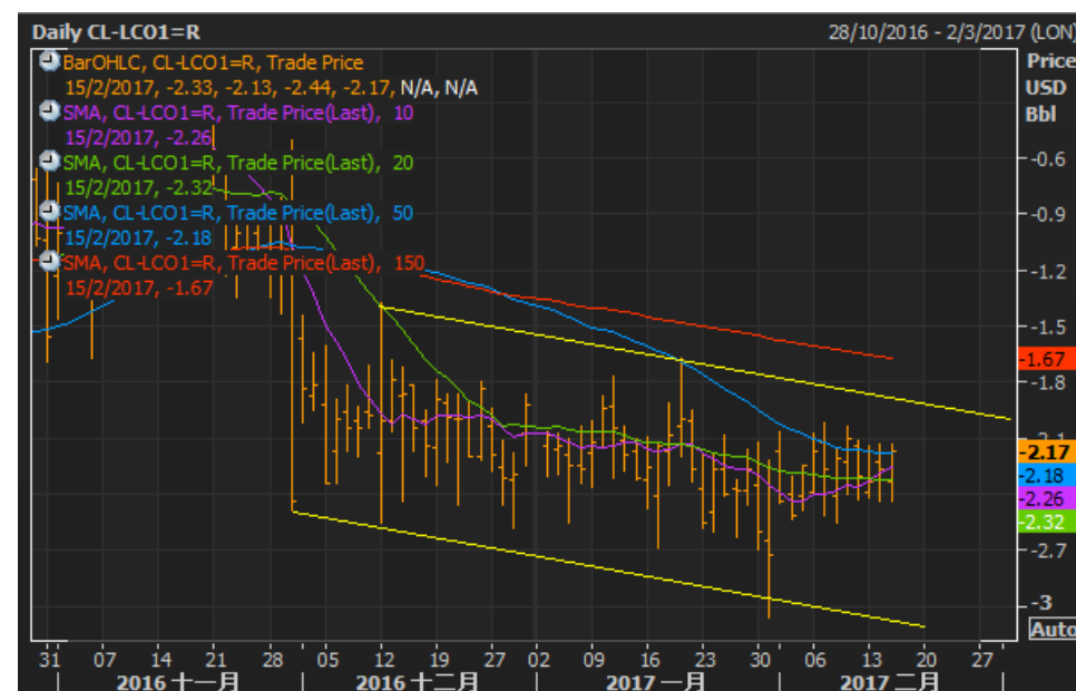
WTI-Brent crude oil price spread daily chart