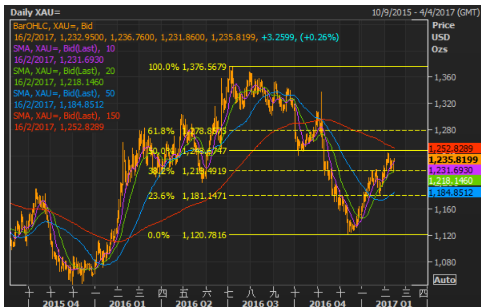
Gold spot daily chart

Technically speaking, as we have mentioned previously, gold still looks good and now odds is running in its favour and a clear break above $1239 will most likely send it to the next target at $1250. Support now lies between $1225 - $1228 area and any dip to that level should attract bids. Silver looks poised for a move up to $18.15 with potential to attack $18.40 before end of this week. Support should come in from $17.8250 with $17.75 being the next.